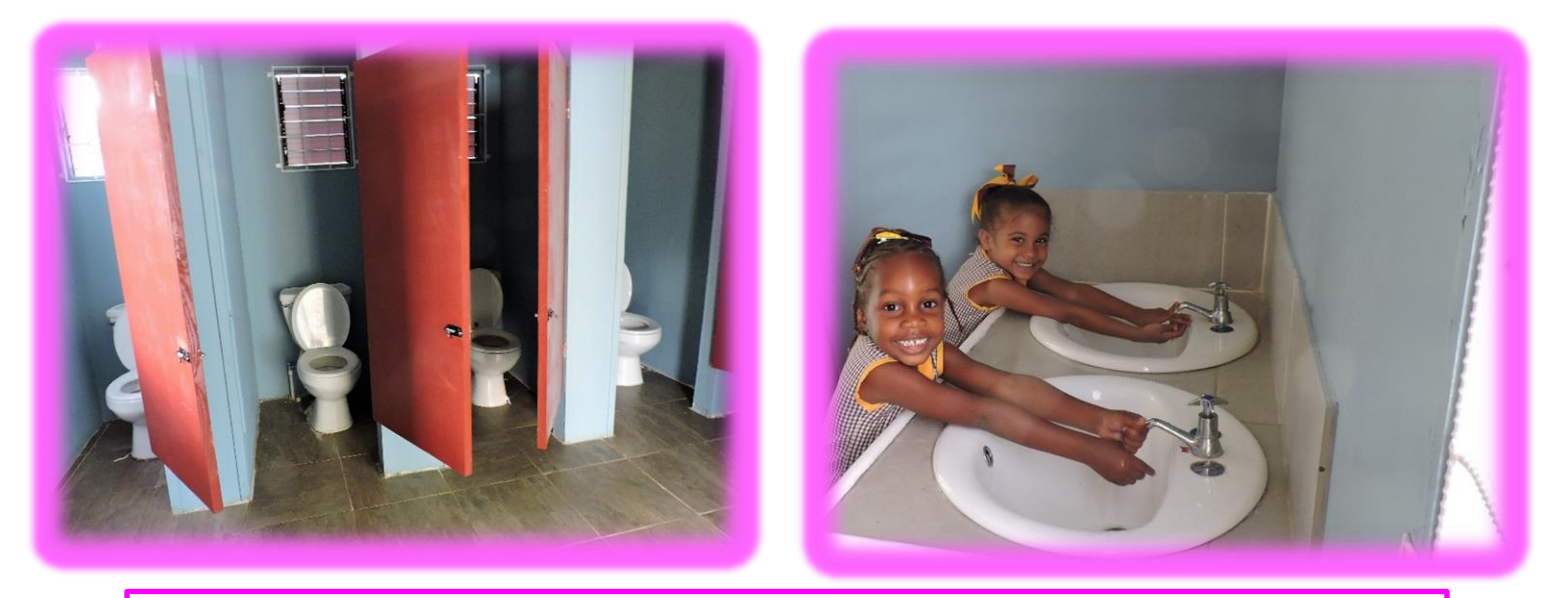
The student's bathroom includes adequate and separate stalls with modern flush toilets, wash basins and shower.

Ms. Karlene Paisley , is the Caregiver at the infant department, who mainly assists in the K1 classroom. Ms. Paisley mentioned that, "I am extremely thankful that we have bathrooms attached to the infant department. When we moved into the building in September, construction was not 100% complete, which includes the bathroom area. As a result, I had to take the children to the primary school to use the bathroom and sometimes, by the time we got to the bathroom, the student would urinate or defecate on themselves. Having the bathroom completed, reduces that likelihood of those situations."