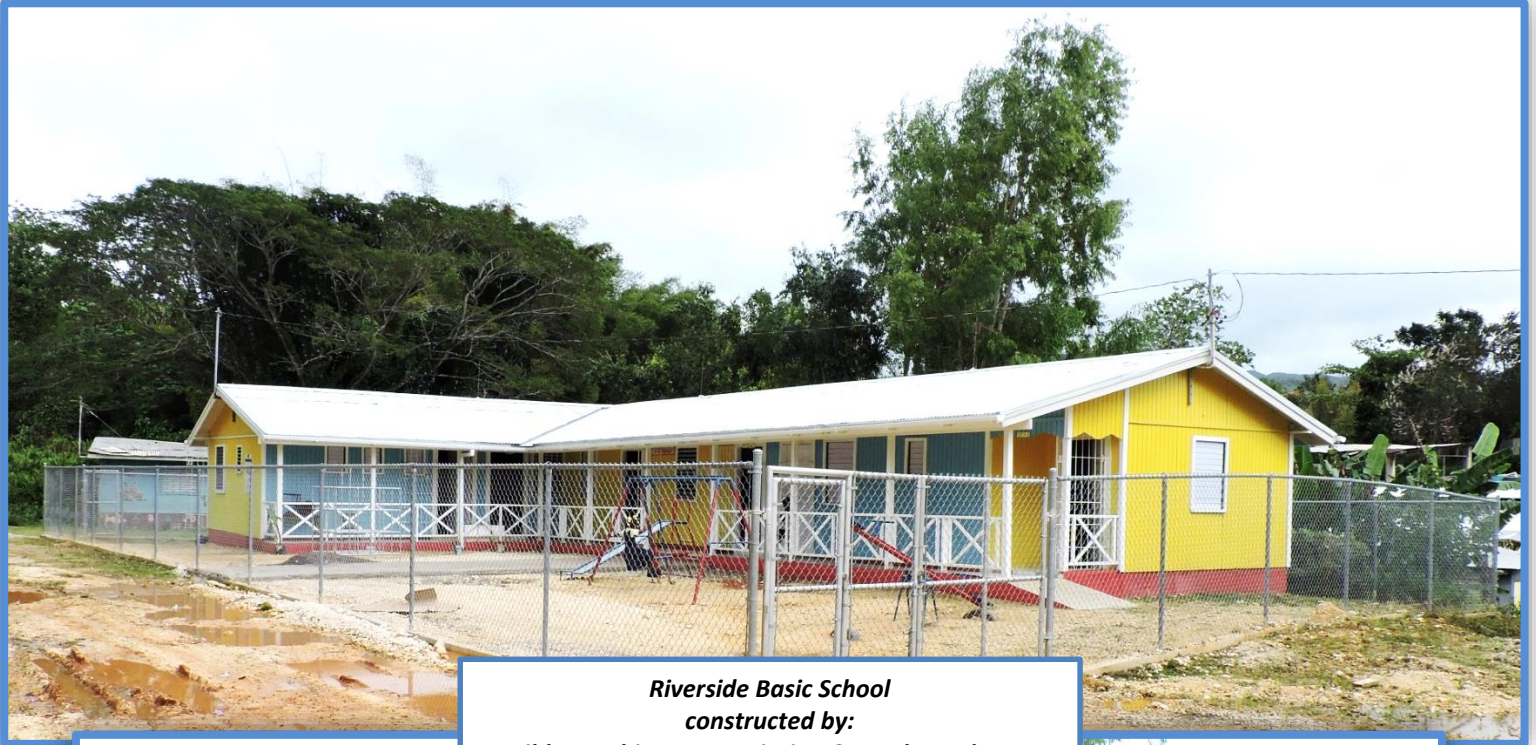
Riverside Basic School constructed by: Caribbean Chinese Association & Food For The Poor